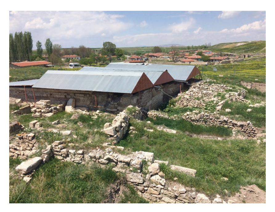
Fig. 3.2 Amorium, seventh-eighth century bathhouse and late ninth-tenth century enclosure

rebuilt after the siege and destruction of the city on the part of the Abbassid Caliph al-Mut'assim in 838 (Treadgold 1988, 297–9; Lightfoot and Lightfoot 2006, 51–5).